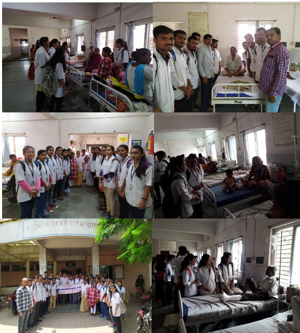
Photo: Hospital Visit